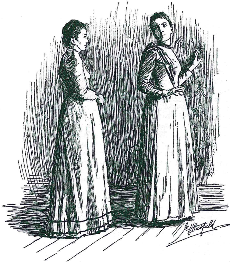
“She didn't know I was in the Room.”